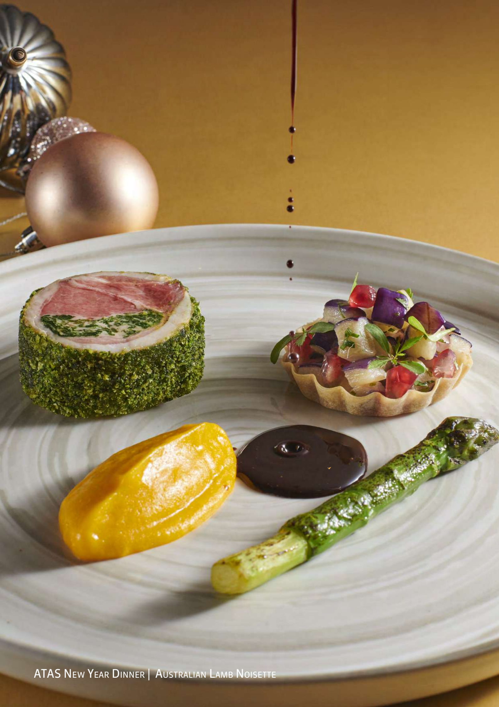
ATAS NEW YEAR DINNER | AUSTRALIAN LAMB NOISETTE