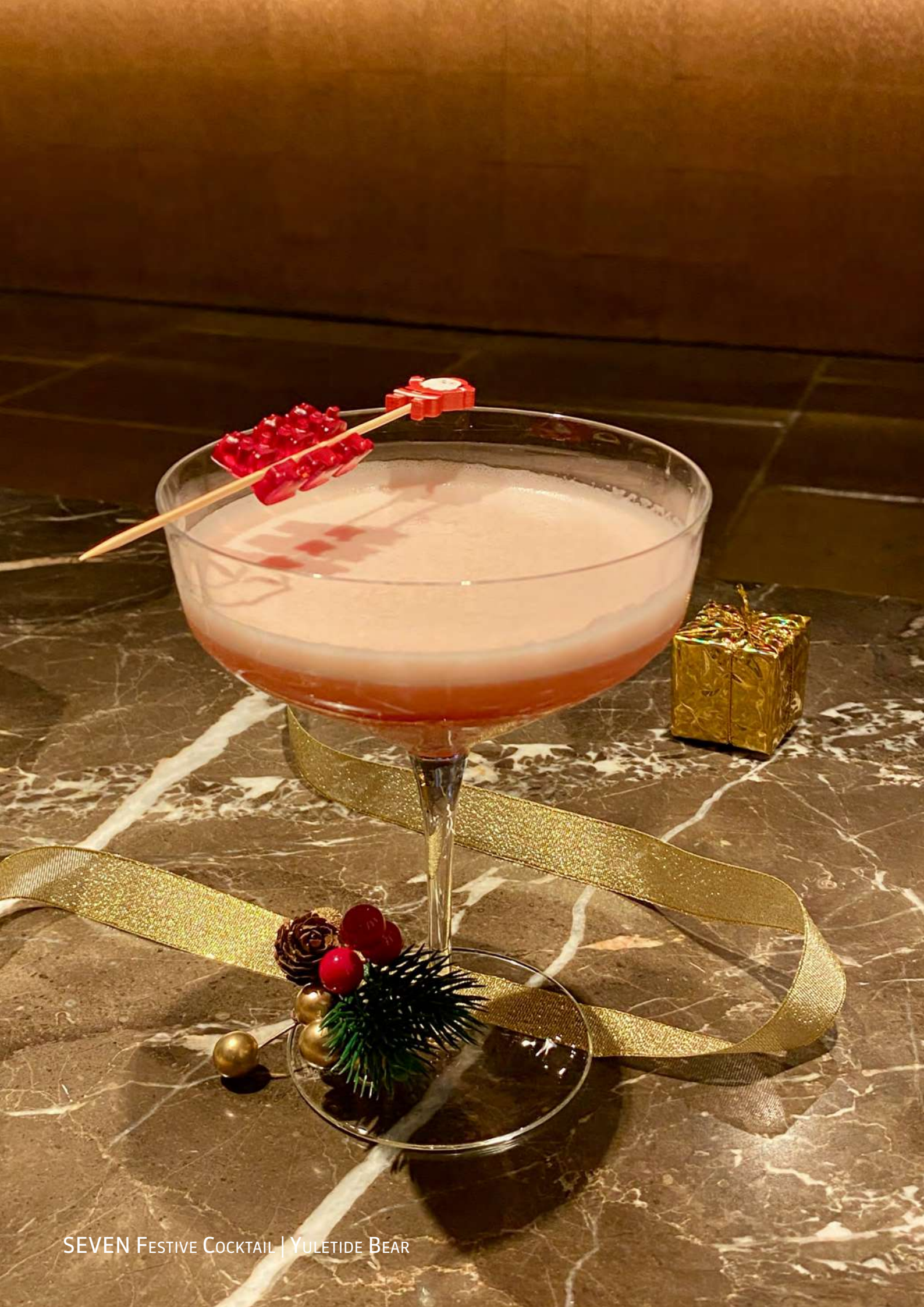
SEVEN FESTIVE COCKTAIL | YULETIDE BEAR