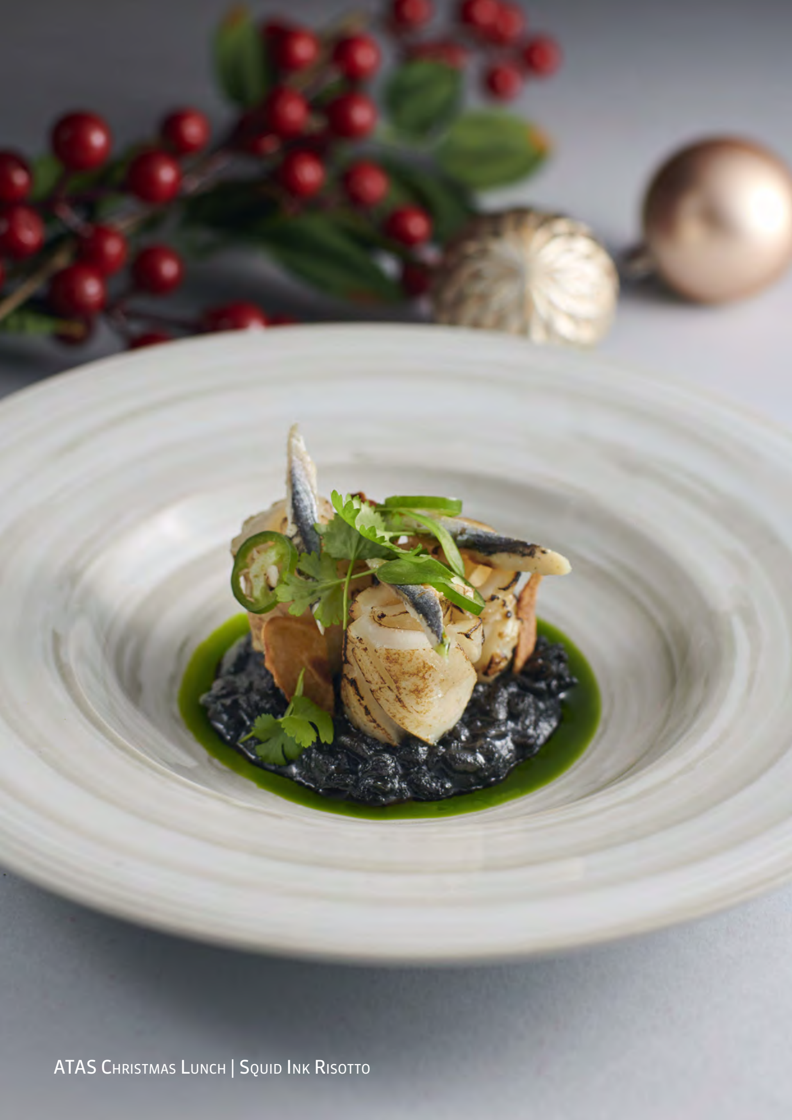
ATAS CHRISTMAS LUNCH | SQUID INK RISOTTO