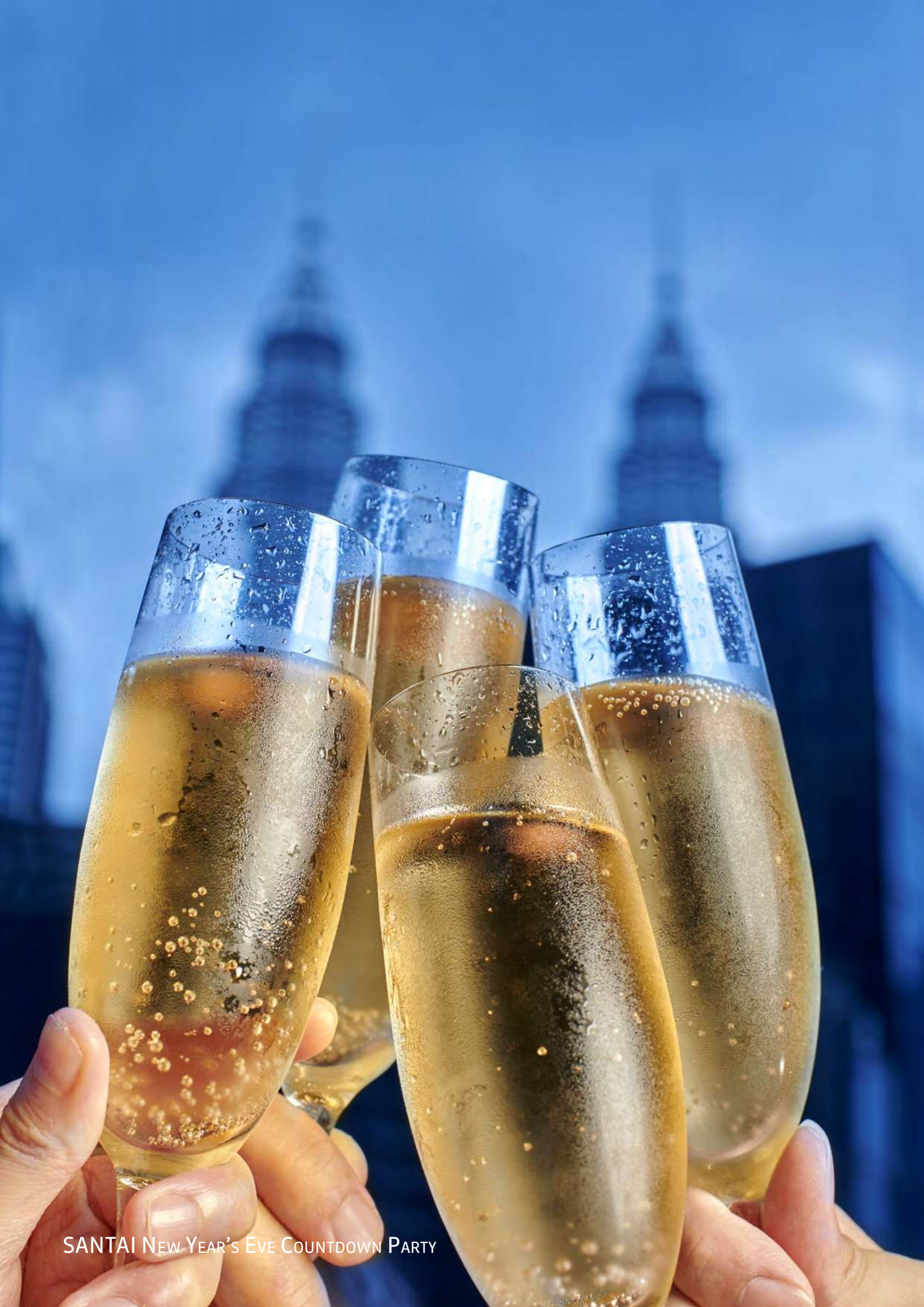
SANTAI NEW YEAR'S EVE COUNTDOWN PARTY