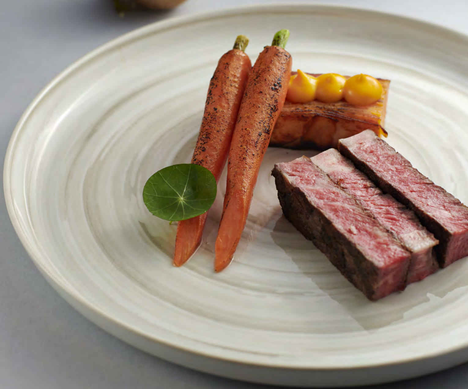
ATAS CHRISTMAS DINNER | AUSTRALIAN ANGUS BEEF STRIPLON