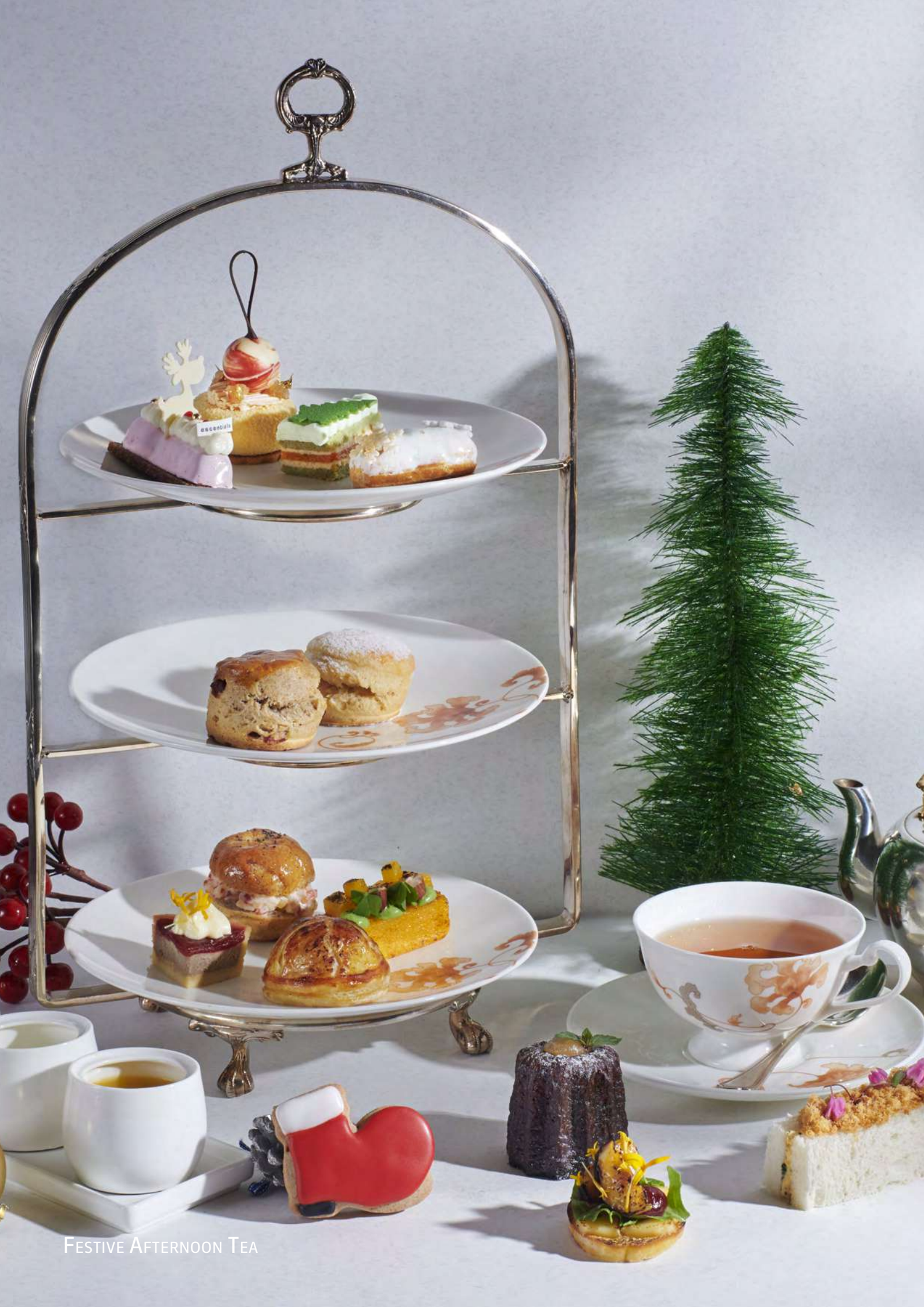
FESTIVE AFTERNOON TEA