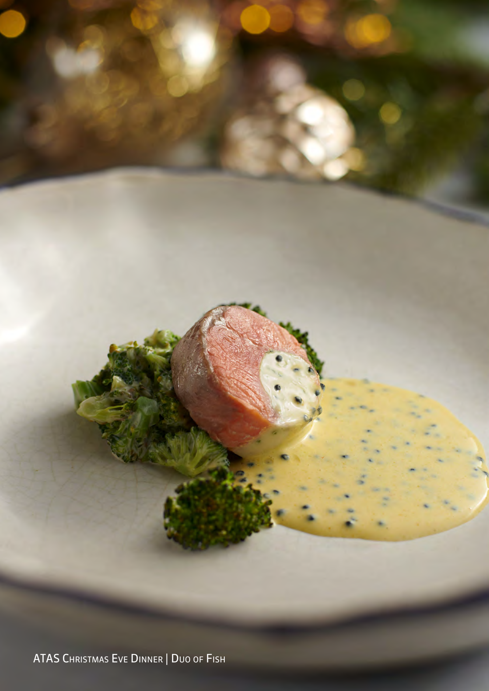
ATAS CHRISTMAS EVE DINNER | DUO OF FISH