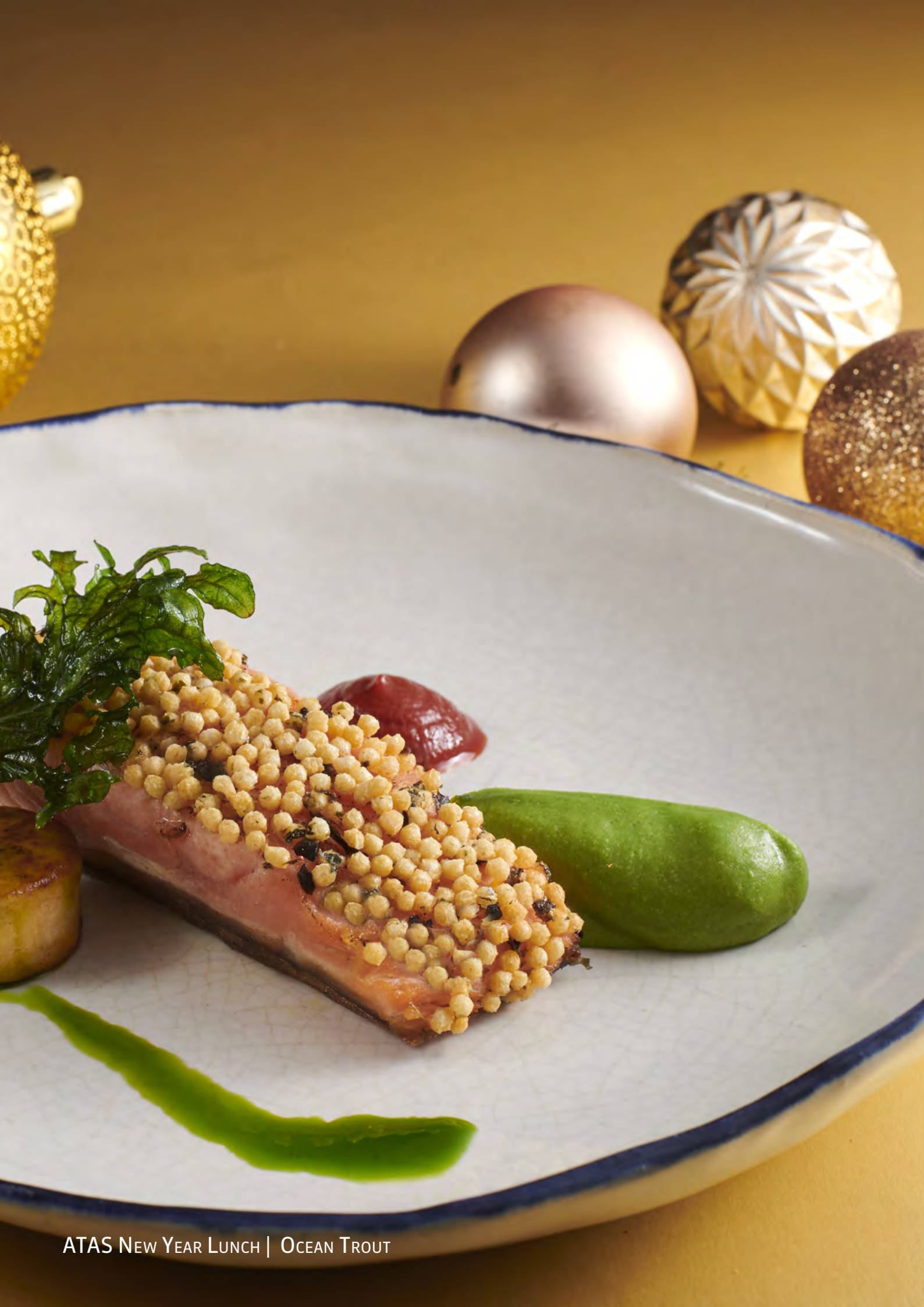
ATAS NEW YEAR LUNCH | OCEAN TROUT