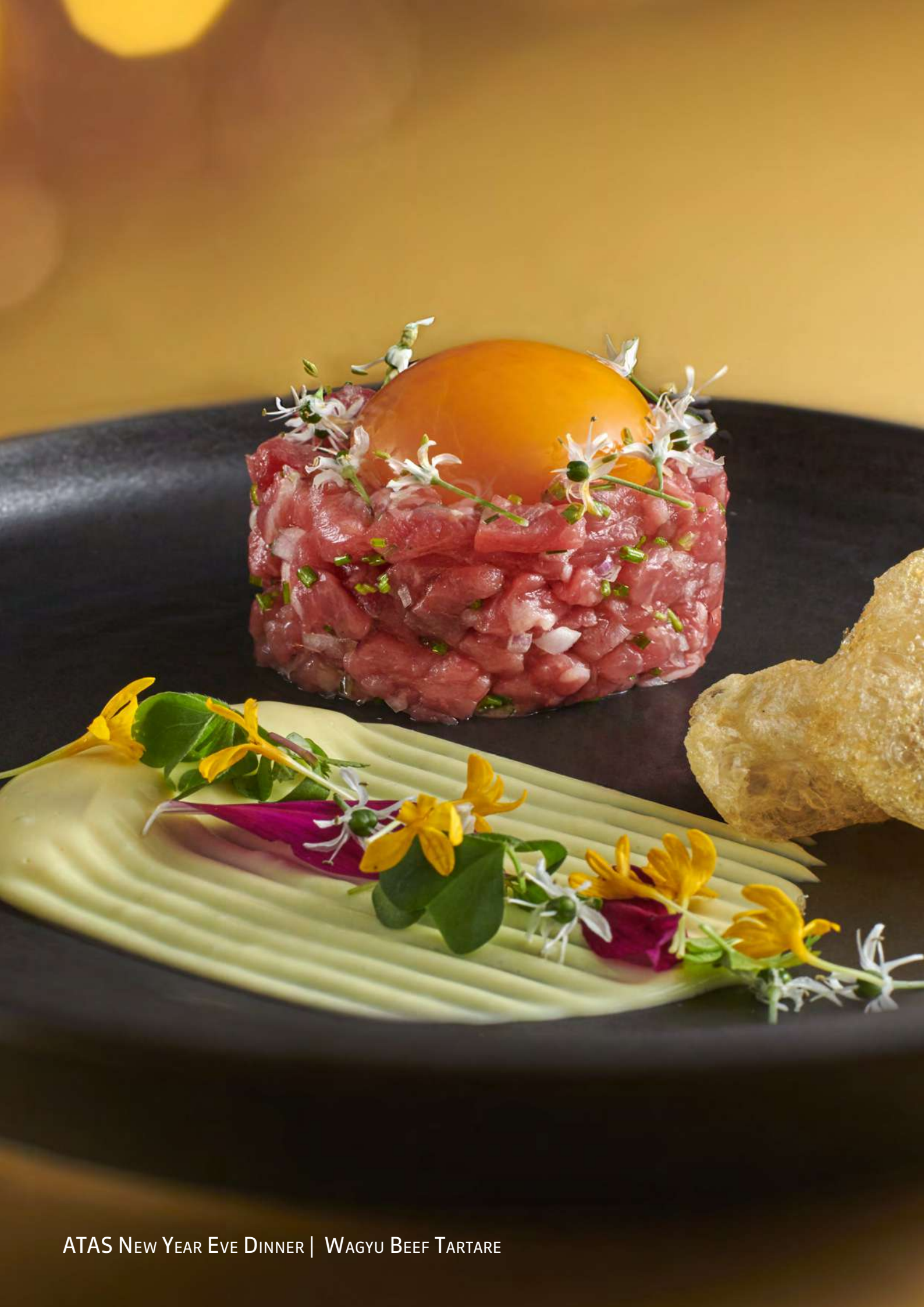
ATAS NEW YEAR EVE DINNER | WAGYU BEEF TARTARE